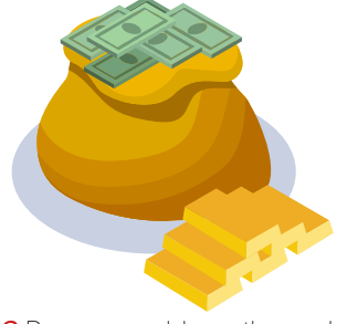
3 Pearce would use the cash to purchase gold bullion from a dealer based in Hatton Garden in London.

4 The gold would be collected from the London dealer and sold for cash or retained as gold bars.