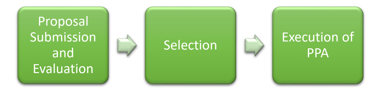
Figure 4 Direct Selection Process

Under direct selection, the bidder's proposal is evaluated based on its tariff proposal. The bidder with the lowest tariff proposal against the maximum ceiling tariff will proceed to negotiate the tariff and execute the PPA with PLN. RE PR caps the time the direct selection process can take at 180 calendar days from the submission of the proposal to the execution of the PPA.