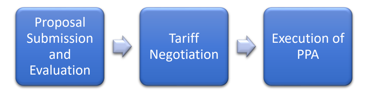
Figure 3 Direct Appointment Process