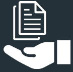
EXPANDING TREATY NETWORK